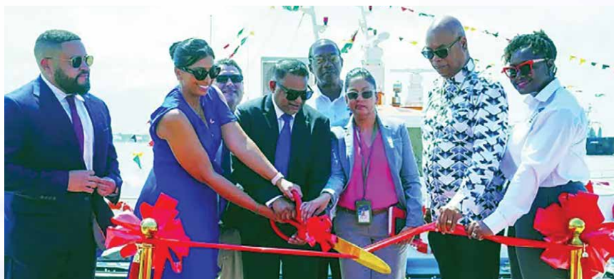
The two new pilot vessels Haiama and Haiakwa.