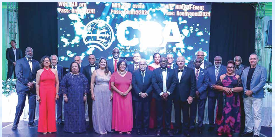
Distinguished members of the CSA Silver Club