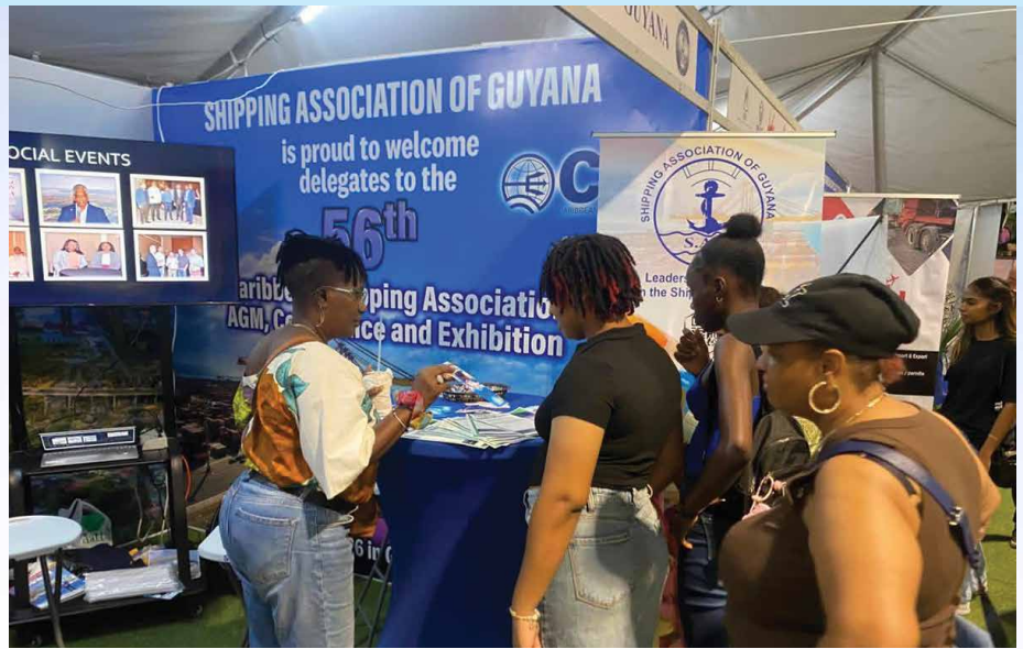
Visitors to the SAG Booth at GuyExpo 2025.

The exhibition took place from November 13-16 at the National Exhibition Centre. The Association expressed its appreciation to all visitors to its booth during the Expo.