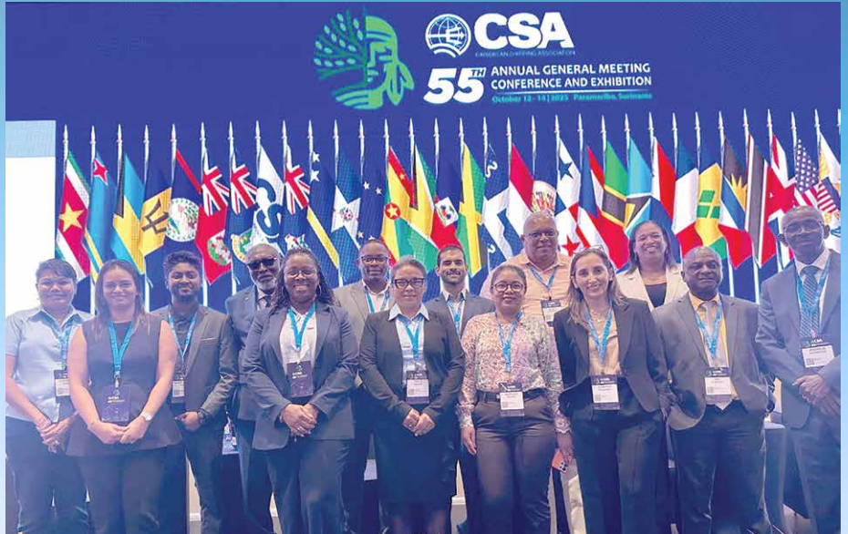
Some members of the Guyana delegation at the CSA Conference in Suriname

The discussions focused on advancing regional shipping collaboration and outlining initial preparations for Guyana's hosting of the 56th CSA AGM and Conference in Georgetown in 2026.