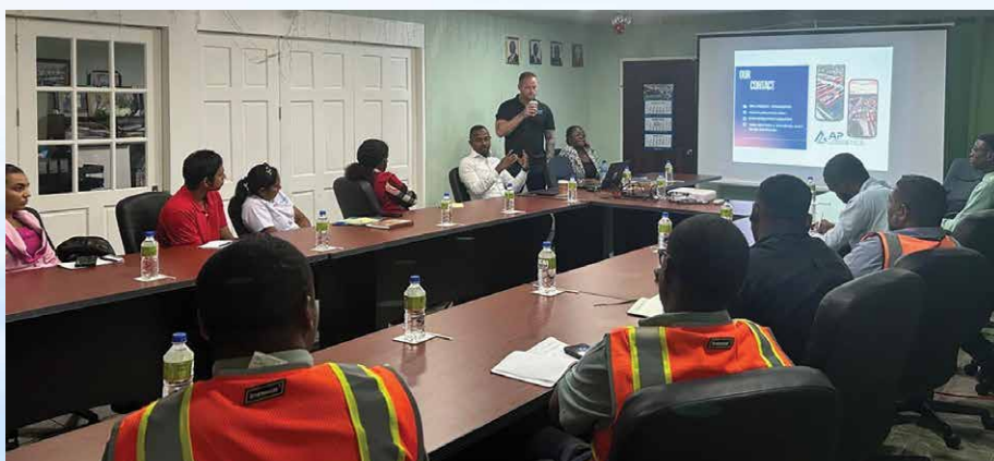
AP Logistics facilitator during his presentation at the IMDG Training

The Session was conducted by a team from AP Logistics, an international Company experienced in the handling of dangerous goods and operating in the Shipping Sector in Guyana. By investing in IMDG training, stakeholders can ensure a safer, more compliant, and efficient transportation process.