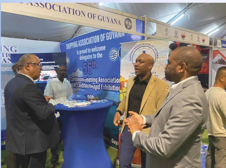
SAG Executives in discussion with visitors.