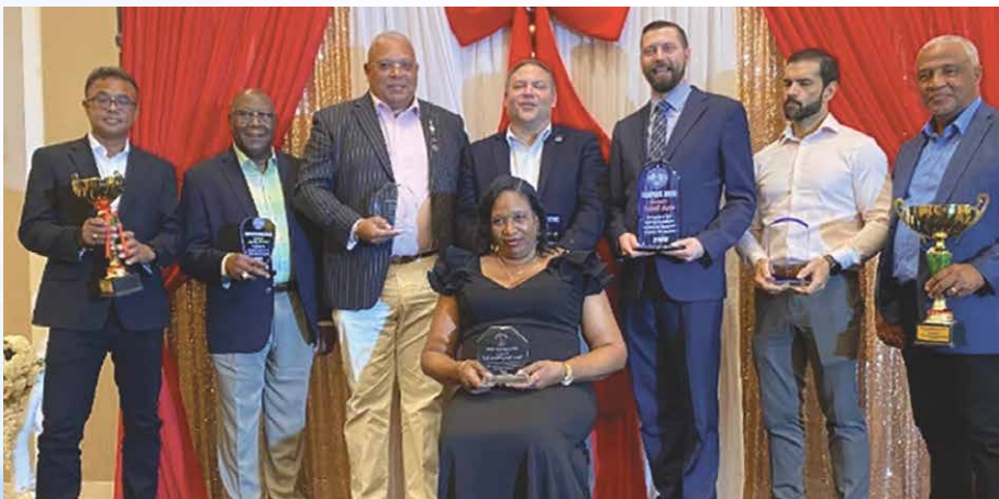
Awardees at the SAG Annual Dinner and Awards ceremony